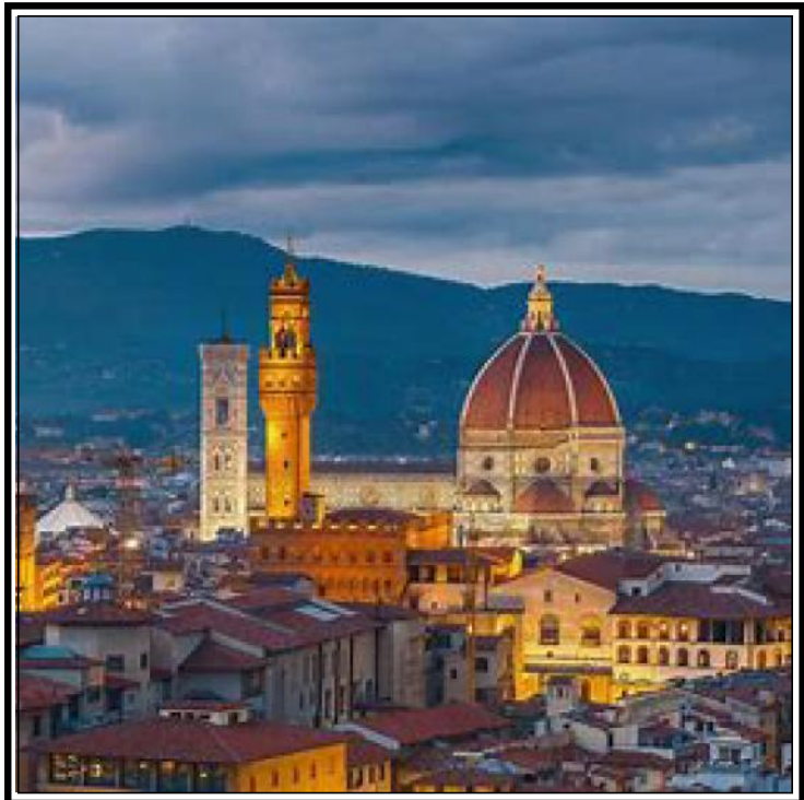
Duomo Santa Maria del Fiore - Florence