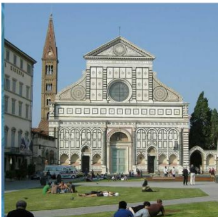
Can you name the architecural style???

Book early at info@hoteladriatico.it (or fax to +39.055.289661). Use the form on page 17.