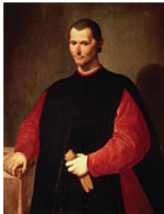
Niccolò Machiavelli 1469 - 1527

Florentine architects such as Filippo Brunelleschi (1377–1466) and Leon Battista Alberti (1404–1472) were among the fathers of both Renaissance and Neoclassical architecture. The cathedral, topped by Brunelleschi's dome, dominates the Florentine skyline. The Florentines decided to start building it – late in the 13th century, without a design for the dome. Brunelleschi's 14th century project was the largest ever built at the time, and the first major dome built in Europe since the Pantheon in Rome, and Hagia Sophia in Constantinople. The dome of Santa