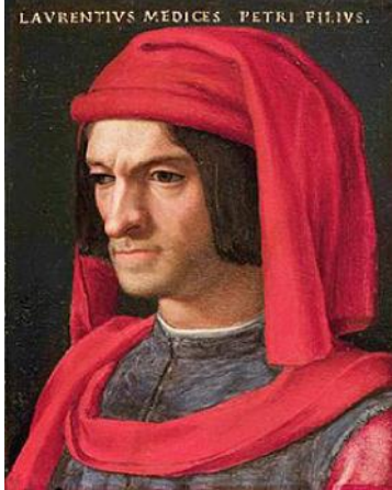
Lorenzo de' Medici 1449 - 1492

The Palazzo Vecchio is the town hall of Florence and also an art museum. This large Romanesque fortress-palace overlooks the Piazza della Signoria with its copy of Michelangelo's David