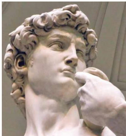
Who is this???