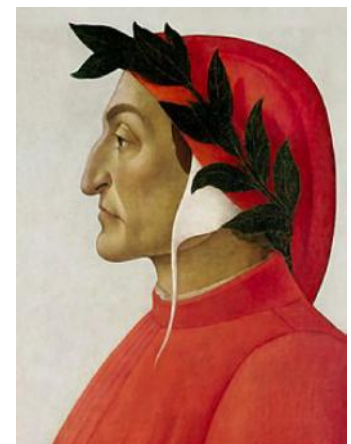
Dante Alighieri c. 1265 - 1321

In the 16th century, during the Renaissance, Florence was the home town of political writer and philosopher Niccolò Machiavelli, whose ideas on how rulers should govern the land, detailed in The Prince , spread across European courts and enjoyed enduring popularity for centuries. [Wikipedia].