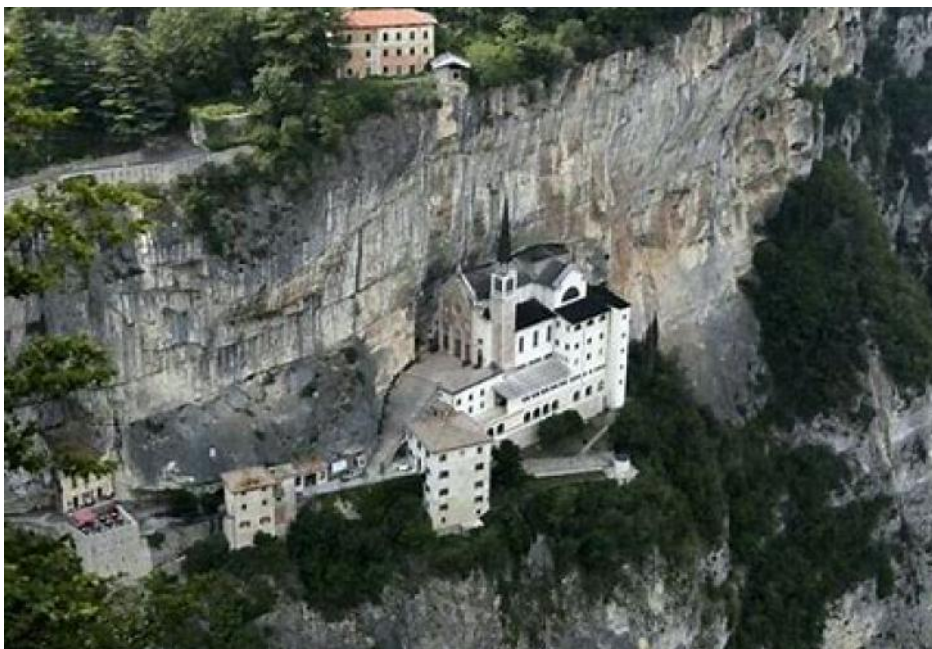
from top: Town square Tuscany, Valley San Gimignano, Corona