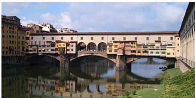
Ponte Vecchio Florence