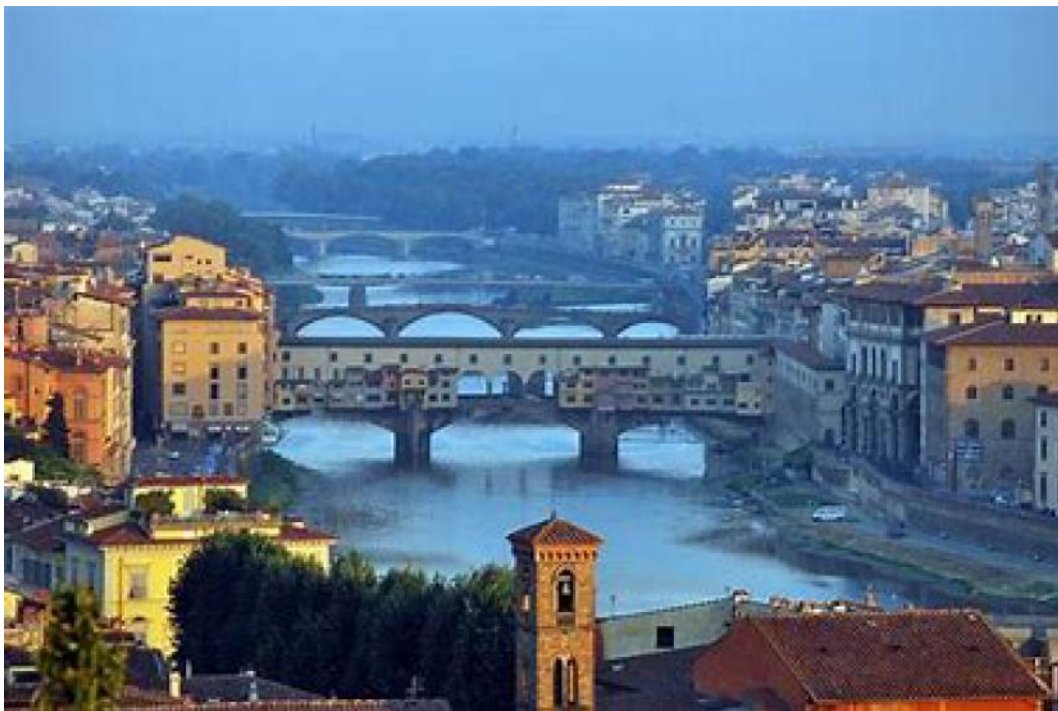
Florence - Ponte Vecchio spanning the Arno River

The church of San Lorenzo contains the mausoleum of the Medici family. Nearby is the Uffizi Gallery, one of the finest art museums in the world. The Uffizi is located at the corner of Piazza della Signoria, the centre of Florence's civil life and government for centuries. In 1301, Dante Alighieri was sent into exile from here and 1504, Michelangelo's David was installed on the Palazzo della Signoria.