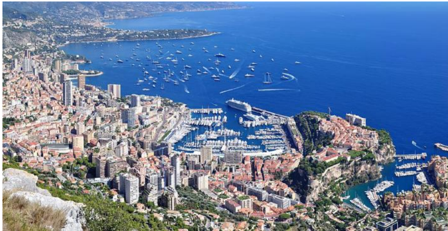
Monaco panoramic view from the Tête du Chien promontory

This coastline was one of the first modern resort areas. It began as a winter health resort for the British upper class at the end of the 18th century. With the arrival of the railway in the mid-19th century, it became the playground and vacation spot of British, Russian, and other aristocrats. In the first half of the 20th century, it was frequented by