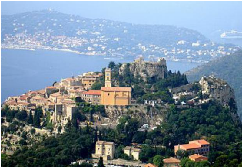
Èze viewed from Gran Corniche

Èze, renowned tourist site on the French Riviera, is famous worldwide for the view of the sea from its hill top. Its Jardin botanique is known for its collection of cacti and succulents and its panoramic views. The oldest building in the village is the Chapelle de la Sainte Croix (1306). The small medieval village is famous for its beauty and charm. Its many shops, art galleries, hotels and restaurants attract a large number of tourists and honeymooners. As a result, Èze has become dubbed by some a village-musée , as few residents of local origin live here. From Èze there are gorgeous views of the Mediterranean Sea. Èze Village can be reached from Nice by train to the Èze-sur-Mer station or by bus. Close to the train station is a bus stop bringing tourists to Eze Village in a few minutes.