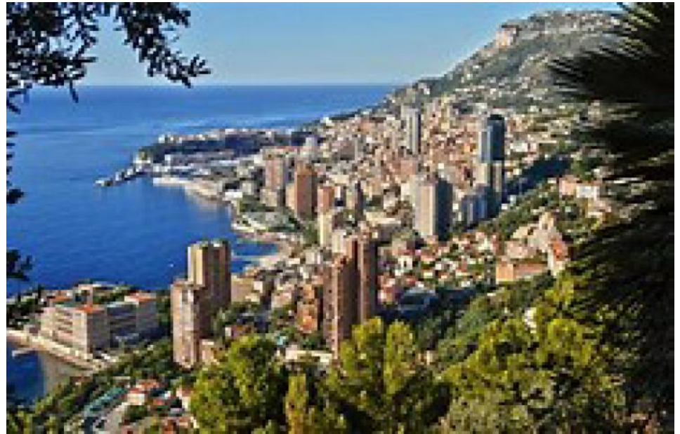
Monaco and Cap d'Ail

at Riviera Marriott La Porte de Monaco Hotel