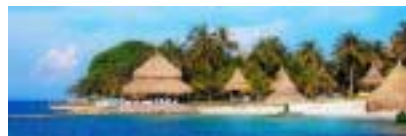
Puntafaro on the island Múcura

Option C: Santa Marta. From USD415 July 1-3, 2010 -3 days, 2 overnight (in single room). Hotel Irotama. Includes transportation, breakfast buffet, activities, guided events. Flight connections: Santa Marta (SMR) to Bogotá to Miami. Santa Marta was founded by the Spanish in 1525. Beautiful beaches and majestic mountains of the Sierra Nevada make it a paradise for natives and visitors alike.