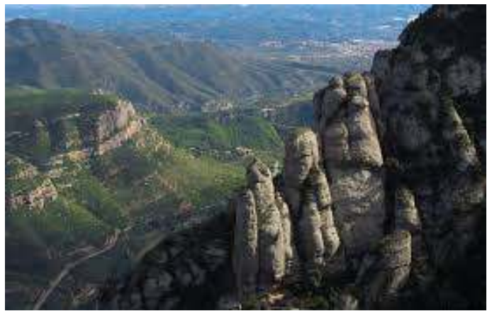
View from Montserrat Monastery (day trip from Barcelona)