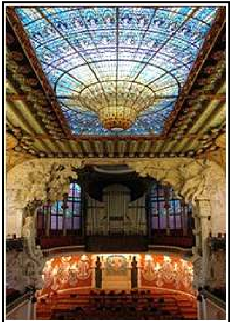
Palau de la Musica Catalana, Barcelona