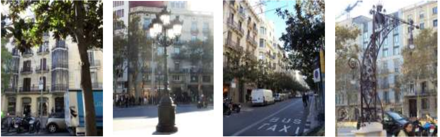
Barcelona Avenues and sites