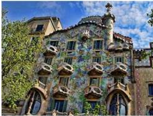
Casa Batlló Barcelona

The Gothic Quarter is the center of buildings date from medieval times, settlement of Barcelona. Catalan the movement known as Art Nouveau between 1885 and 1950 and left an of these buildings are World Heritage work of architect Antoni Gaudí , which best-known work is the immense, but Família , which has been under financed by private donations.