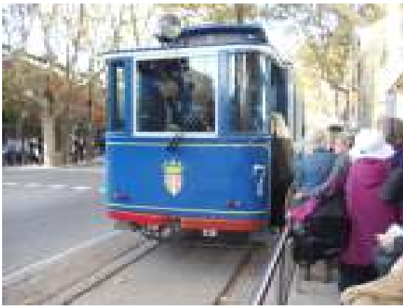
Tramvia to Mt. Tibidabo in Barcelona (half-day trip)