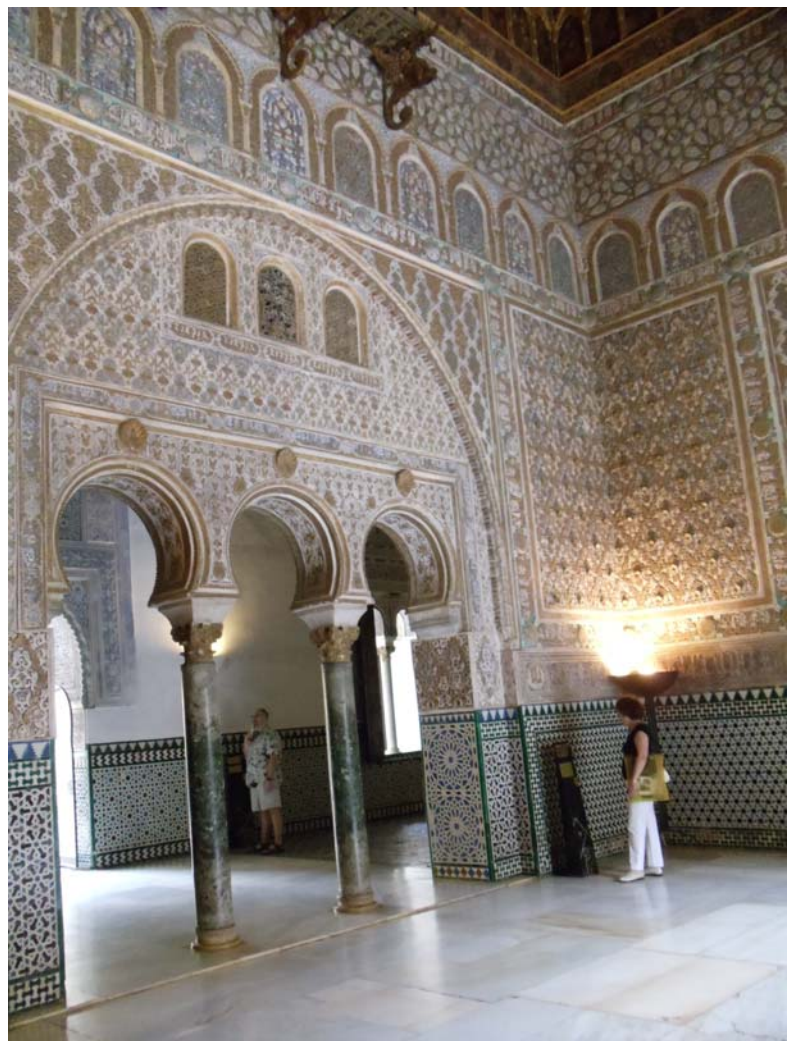
Alcázar, Seville, Spain