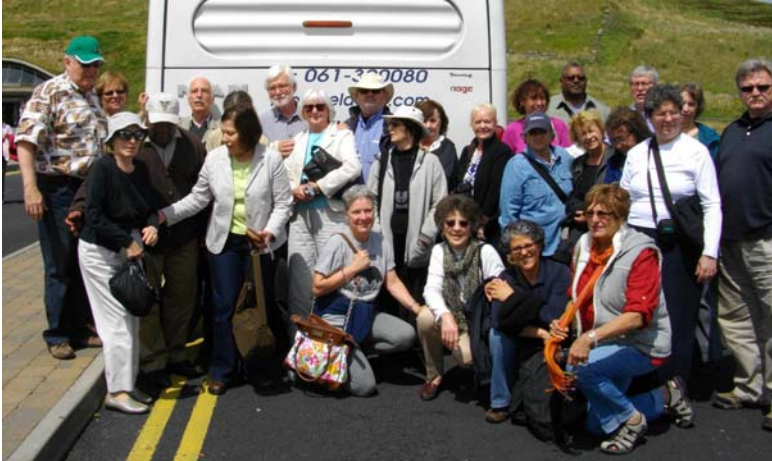
2011 Ireland Conference Educational-Cultural Post Tour