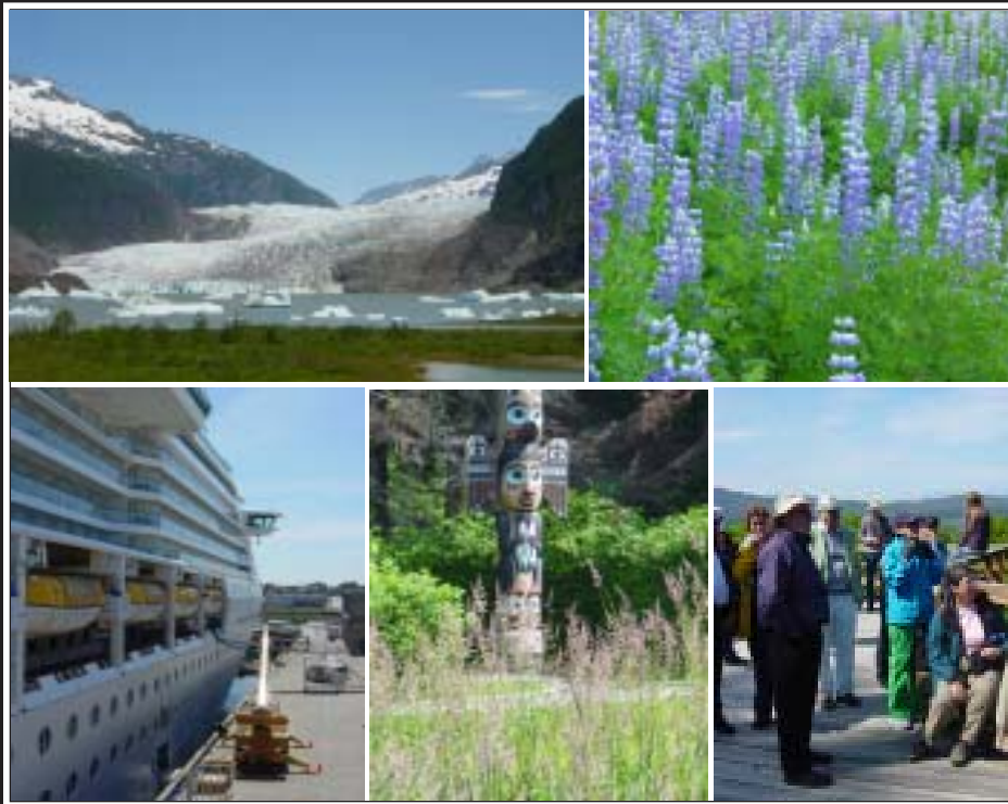
Post Conference Alaska Cruise

*Colombian novelist and short-story writer, 1982 Nobel Prize for literature.