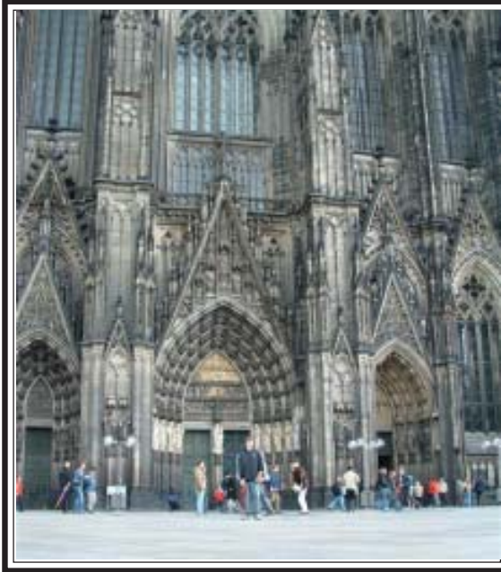
Cologne Cathedral (Kölner Dom)

The Rhine River is dominated by passenger ferries, rowboats and pleasure boats. Cologne is Europe's second-largest inner harbor, with five ports on the Rhine. Eight stunning bridges span the river, giving the city its unique look. Cologne's time-honoured symbol, the cathedral, now has high-tech competition: the prominent crane buildings in the new