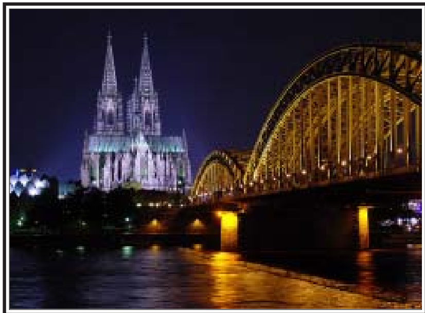
Cathedral Cologne, Germany

For the Call for Papers , the Preliminary Program and the Registration form , refer to pages 13-15 of this NEWSletter. Visit www.wacra.org for further details and frequent up-dates.