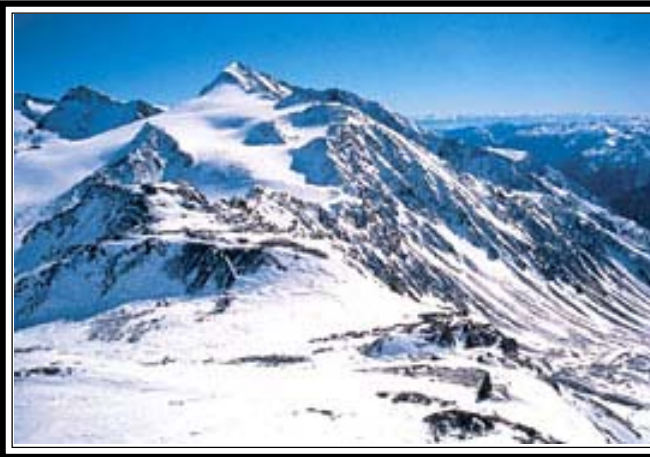
Location where Iceman was found

Before the latest evidence, it was speculated that, rather than fleeing attackers, he was ritually killed to propitiate a god or gods, or that he was a chieftain and,